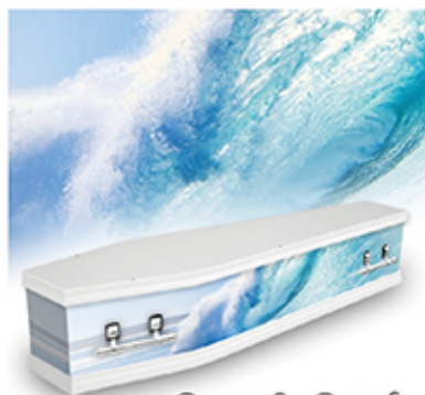
Sea & Surf