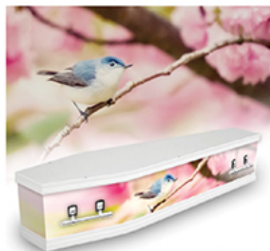
Animals & Nature