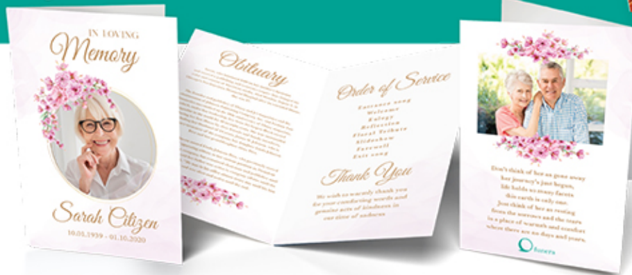
ORDER OF SERVICE BOOKLETS