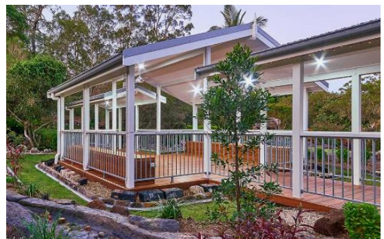
Great Southern Memorial Park