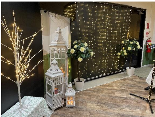
Twilight service at our premises